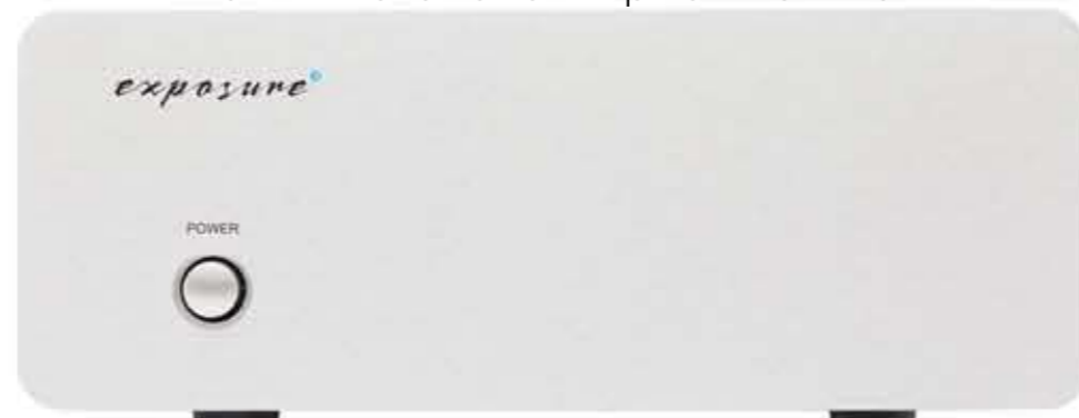
The XM9 Mono Power Amplifier : Front View