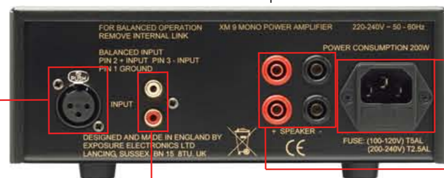
The XM9 Mono Power Amplifier : Rear View