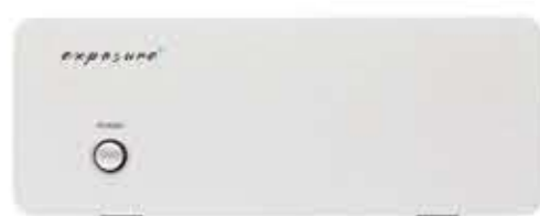
Exposure XM9 Mono Power Amplifier